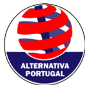
Alternativa Portugal Portugal