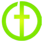
Cristianos en Democracia Spain