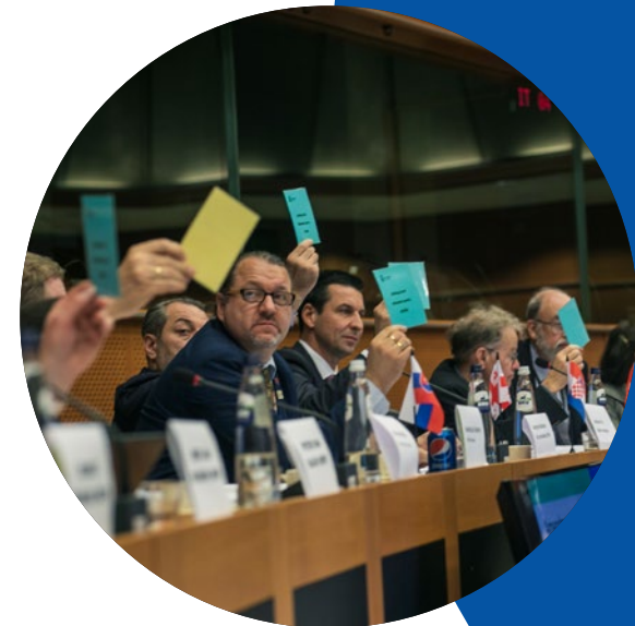
EP- European Parliament

We also looked ahead and discussed strategic ways to make ECPM more visible, more sustainable and more impactful.